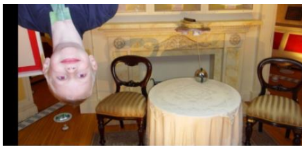
"Me without gravity!"