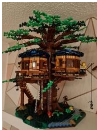
It's been a Lego kind of week!