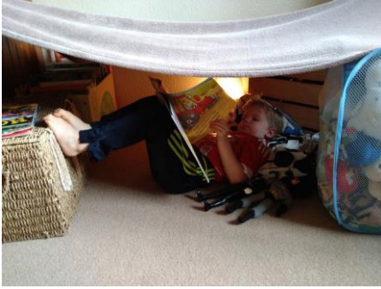
Chillin' with a good book after a hard day's work!