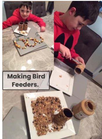
Whether it's feeding the birds or making family treats...we are great at cooking!