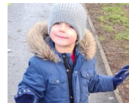
More photos on Page 3!

THANK YOU FOR KEEPING US A CAR FREE ZONE!!