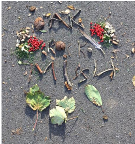
Natural art work in Oak Class.