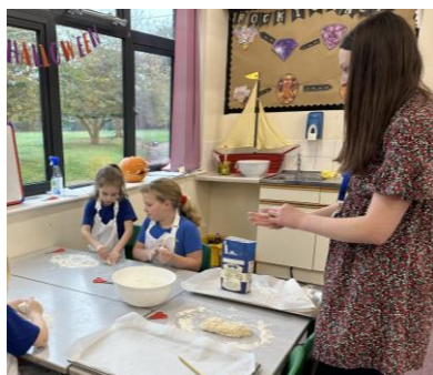
Cherry Class had an Autumn Bread Creation Station!